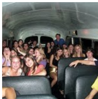
A bus full of Madrichim in training.