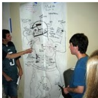
Madrichim in training drawing what they think a leader is.