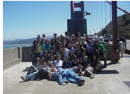
Wheels 2006- Las Vegas, Lake Tahoe, San Francisco, Yosemite...