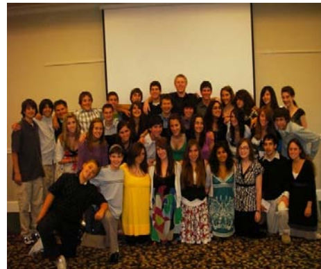
Wheels 2008- Banff, Juneau, Ketchikan, Alaska...