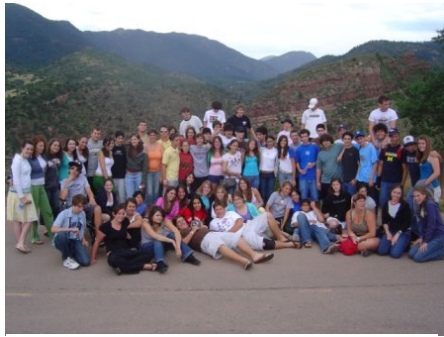
Wheels 2005- Vancouver, Seattle, Denver, Idaho...