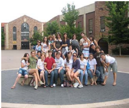
Wheels 2007- Tucson, Boulder, Zion and Bryce National Park...